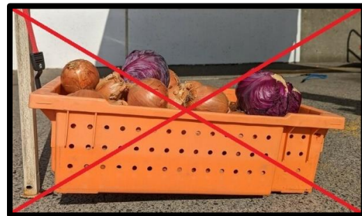
PRODUCT CAN'T BE USED AS WEIGHTS