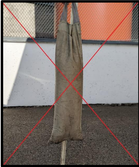
WEIGHTS CAN'T BE SUSPENDED